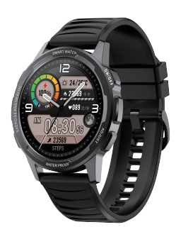
FutureGo Mix L15